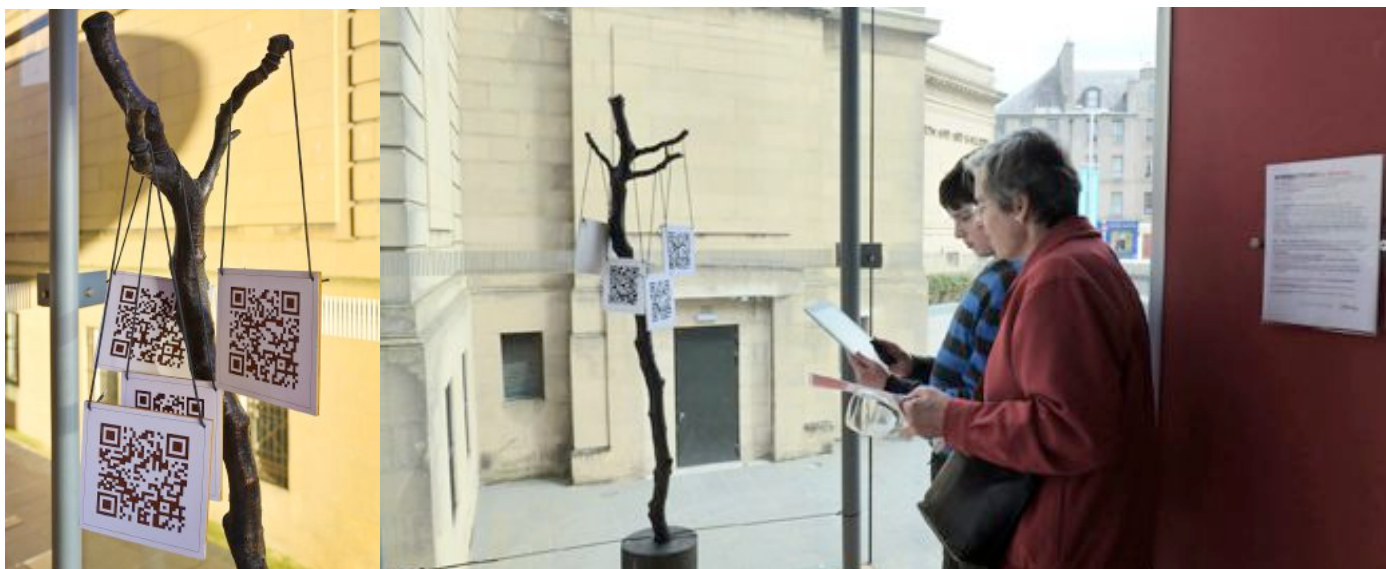
'Sound Tree' using QR codes