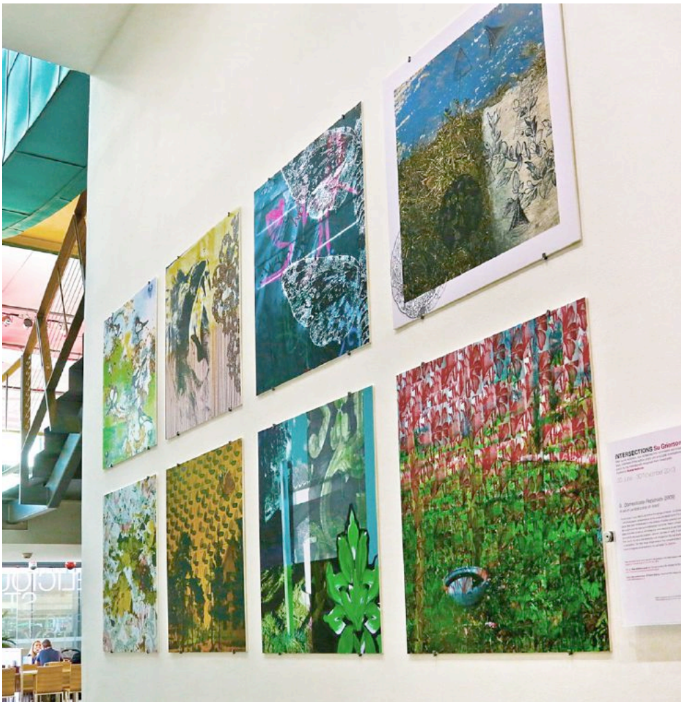
Domesticate – Repatriate images