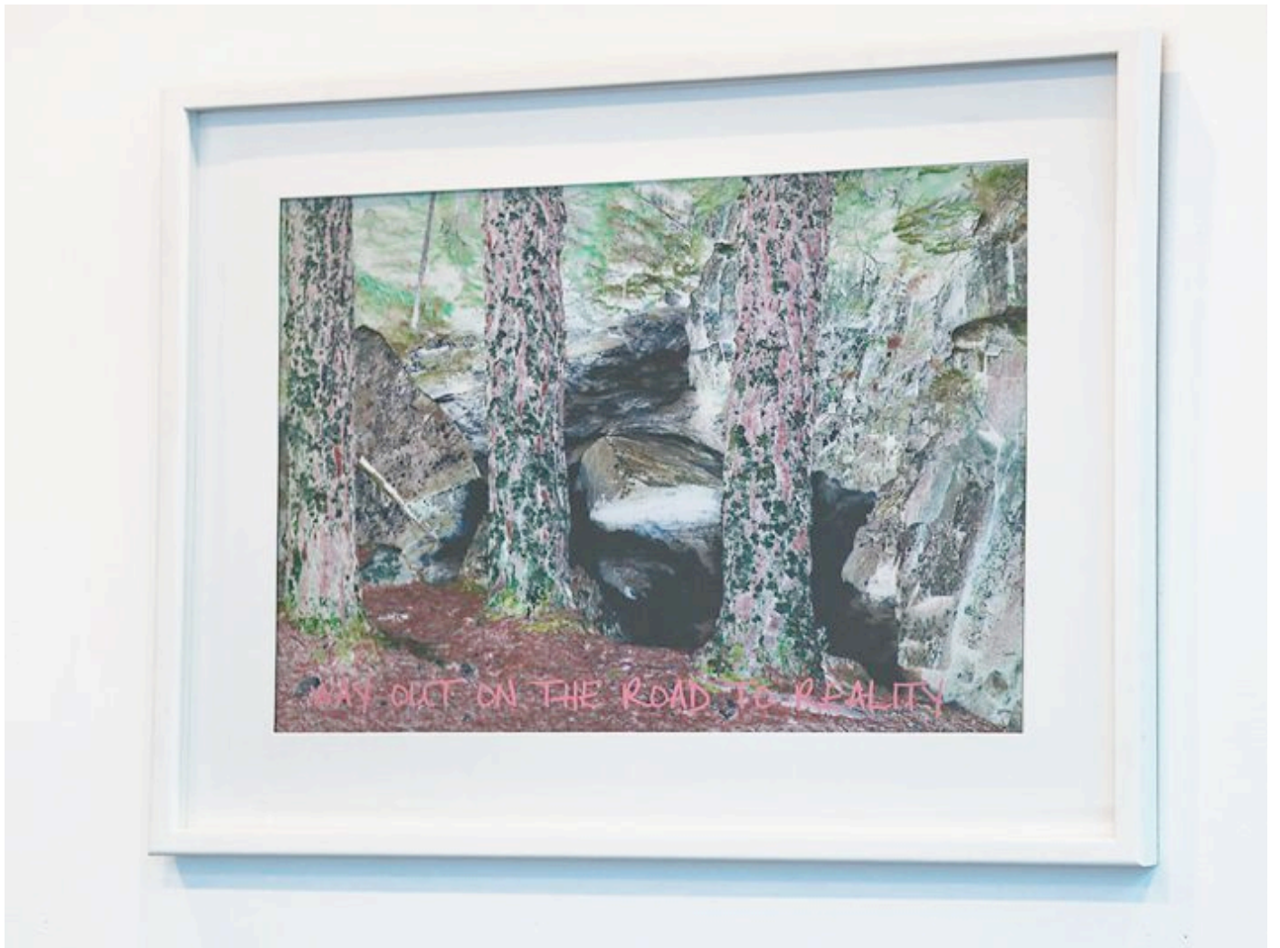
Images from the series 'Text Works'