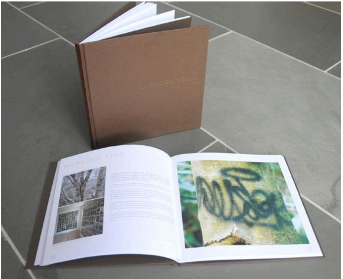
Intersections Book – a survey of the artists projects over 17 years with commissioned articles from other professionals working within the rural agenda.