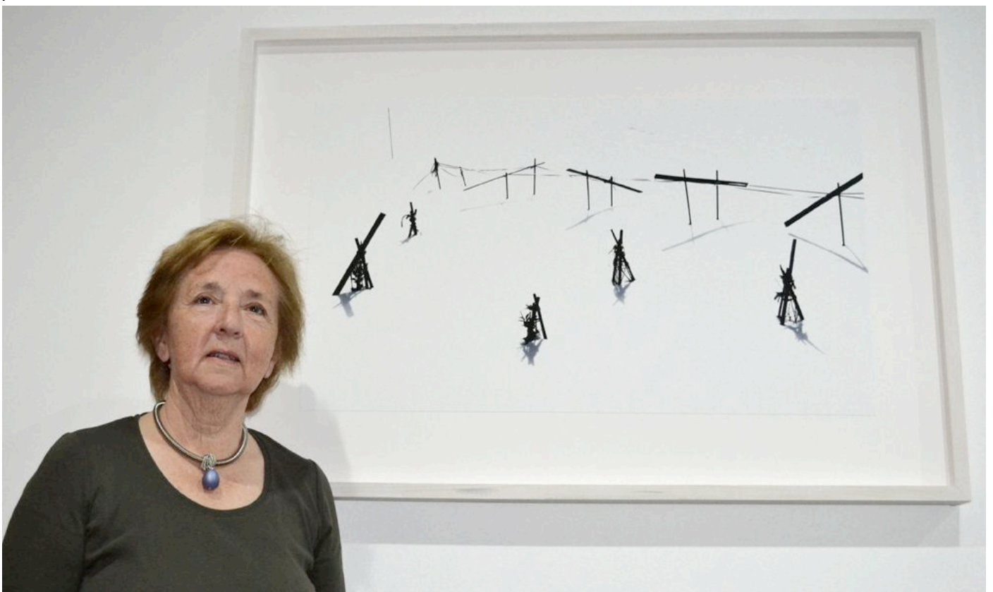
Prints from the series 'Link' produced during a 10 week residency in Fukushima in early 2013