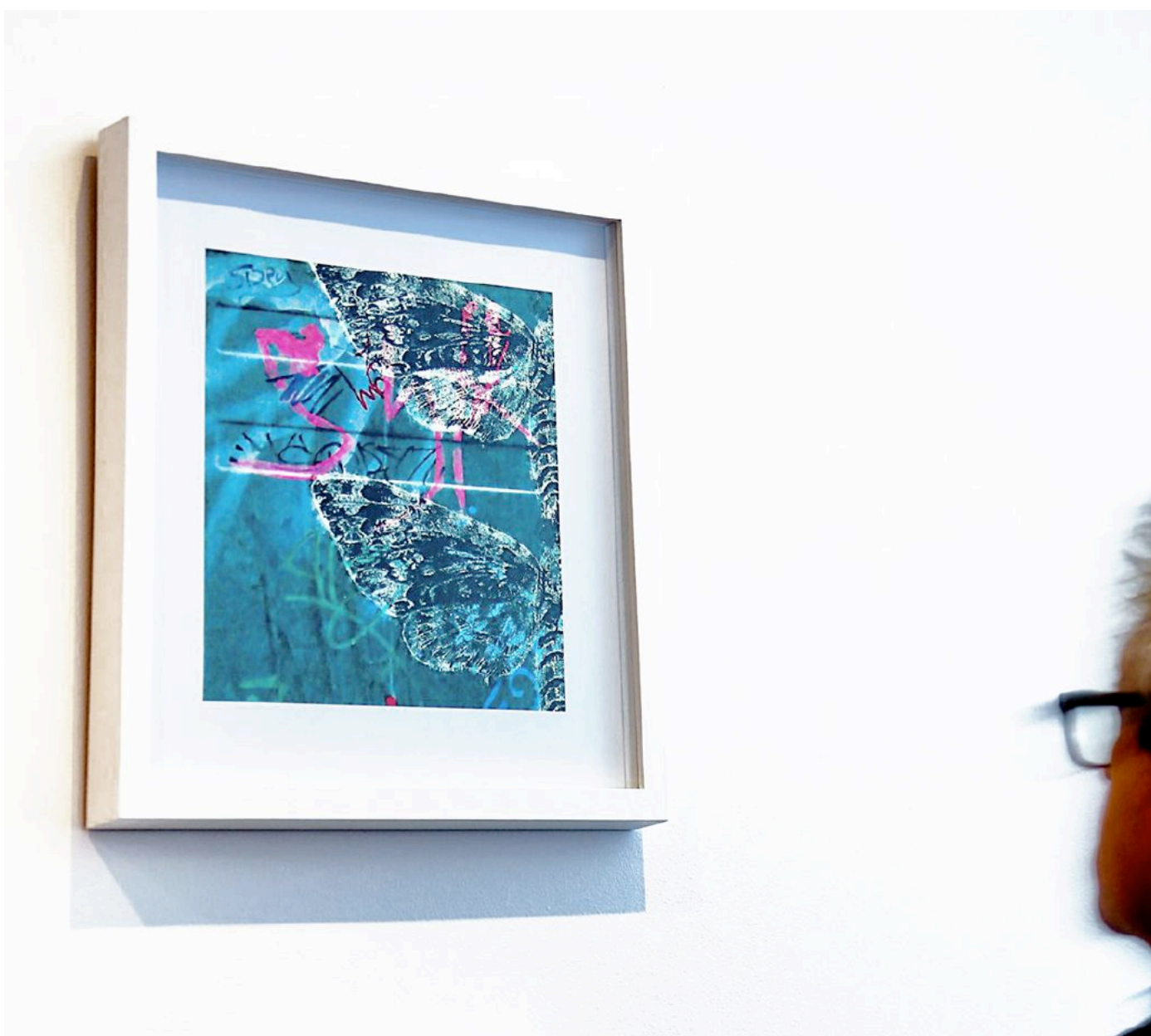
'Moth' limited edition print part of Threshold Arts 'Collect & Support' scheme