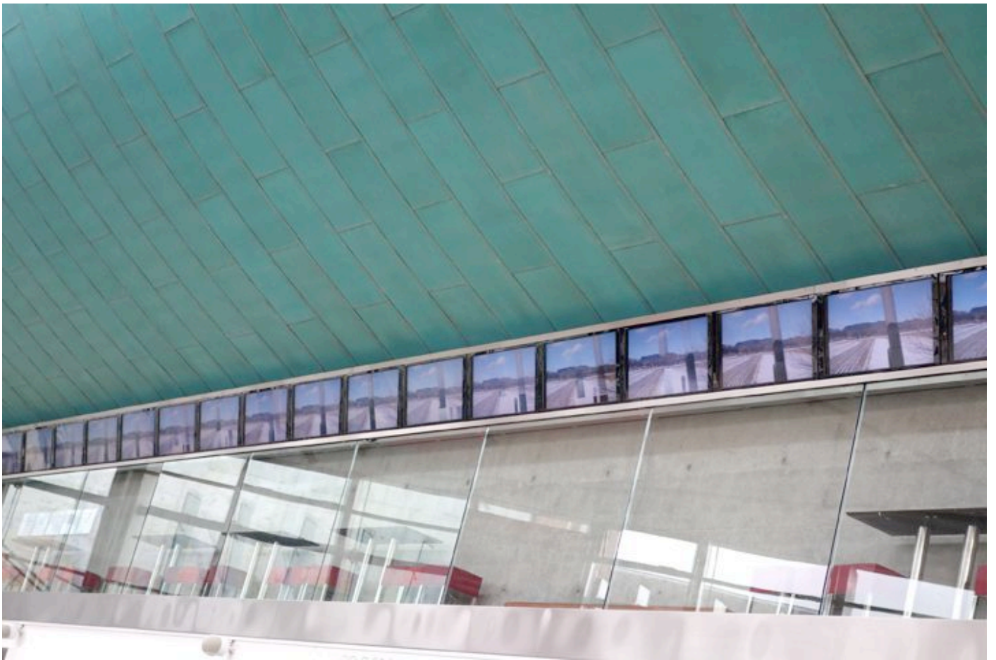
22 screen Threshold Wave