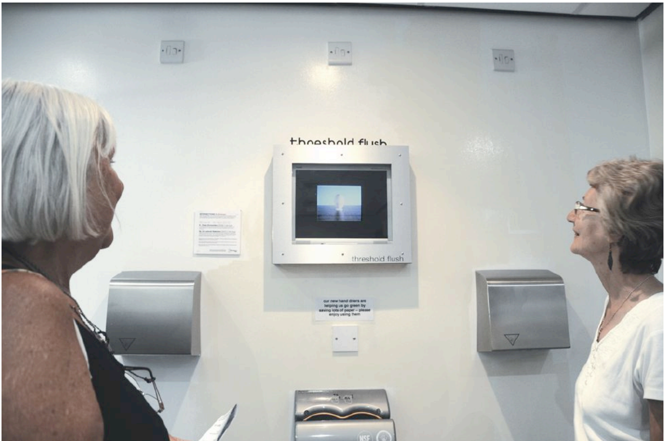
2 videos showing on the Threshold Flush screen