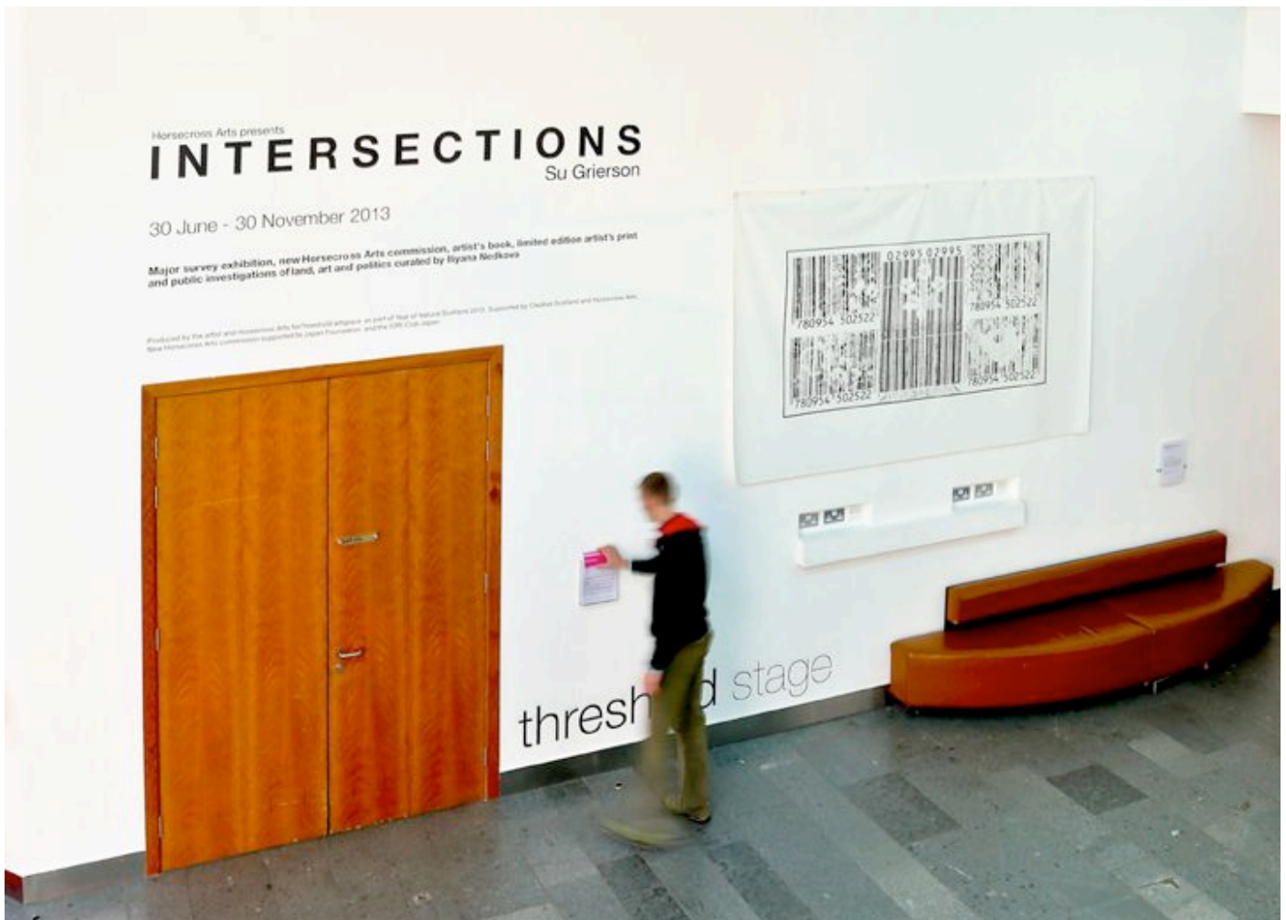
Wall text and BarCode banner

Supported by Creative Scotland and Threshold Arts. Japanese residency The Japan Foundation with the IORI club.