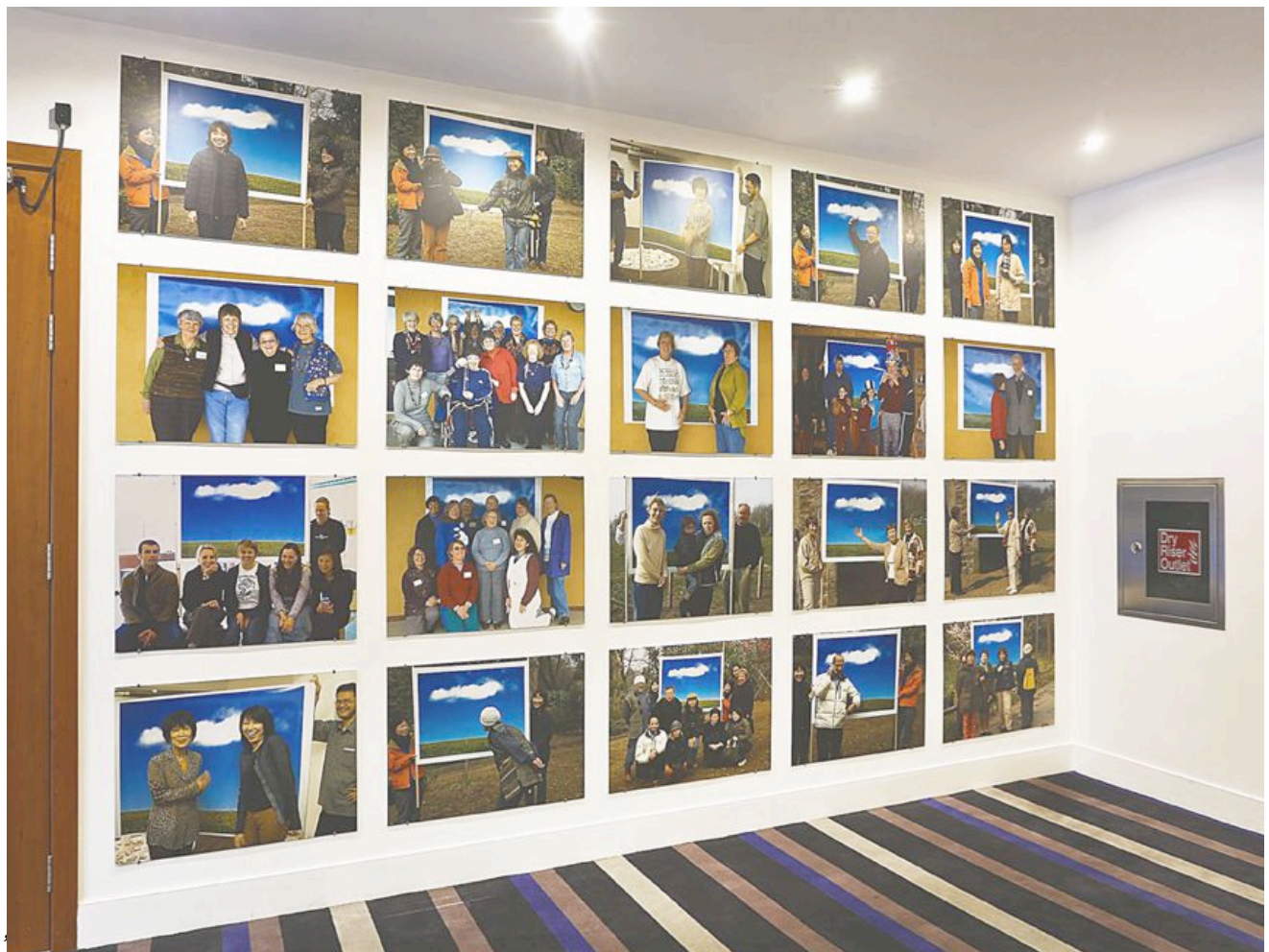
Installed images from the project 'Being There'